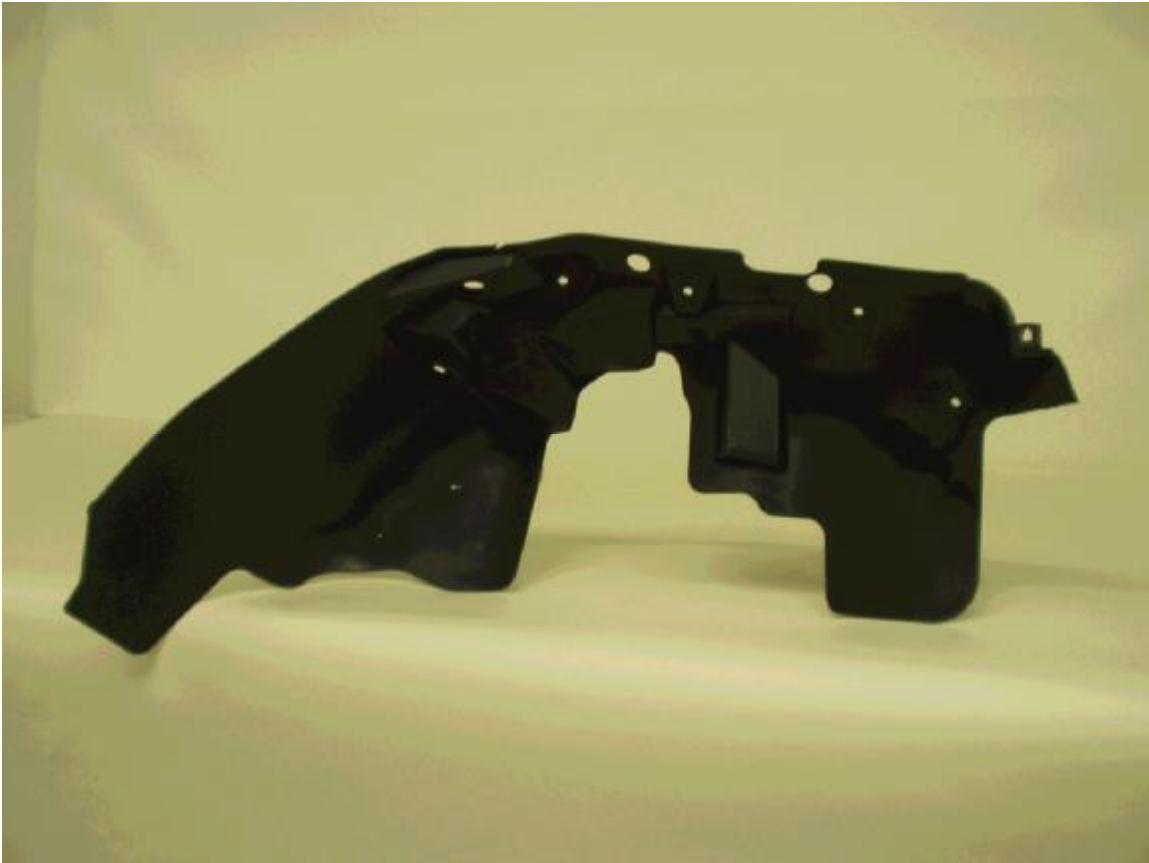
Figure #2- This picture illustrates the driver's side front liner trimmed . The photo is taken from the inside of the liner.

PHASE 2) PREPARATION OF URETHANE PART(S) FOR PAINTING (July, 05): This process is following an approved Sherwin Williams process and materials. Consult your paint supplier for equivalent materials and / or processes.