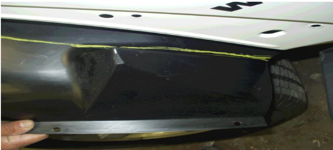
Figure #1 -This picture shows a portion of the front liner marked for trimming. The liner has been pulled out several inches to illustrate the grease pencil trim mark. This view is from the top of the liner looking toward the rearward section of the liner.

Trim the wheel liner where marked with a razor blade knife and clean up the trimmed edges with 150 grit sandpaper (See Fig. 1 & 2).